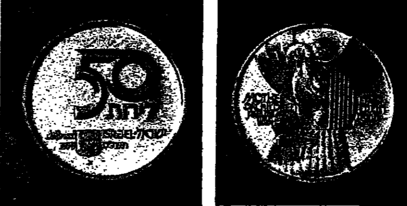
A commemorative coin honouring mothers of large families, bereaved mothers and working mothers, will be issued by the Bank of Israel on Independence Day. The coin has a stylized design of a mother holding her baby aloft while another child clings to her skirts.

LONDON (JTA). — Sir John Cohen, the East End Jewish barrow boy who founded Britain's biggest supermarket chain, Tesco, died yesterday, aged 80. He was a household figure with his boxer's nose and his East End accent.